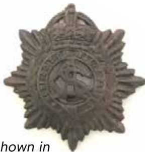
The badge shown in 'Unearthed among the veg' from Issue 6.