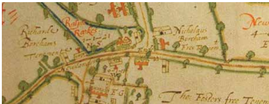
Part of Matching Walker map of 1609 showing managed hedgerows

It's a great way to get youngsters involved in learning about different plants and berries, especially at this time of year.